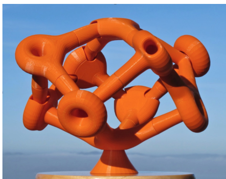
Figure 1: An individual figure [6]. Make it large enough so that necessary details can be seen. Fine-tune its size, so that you obtain convenient page breaks.

If you are writing your paper using \text{\LaTeX} , please use a copy of the source .tex file for this document as your starting point. Some useful \text{\LaTeX} resources are [1, 5]. This template (with its accompanying style file) has been set with the proper paper size and all the necessary styles for proper formatting. Just replace the text in this file with your own text. Also substitute your own images for the figures in this template, either as an individual figure like Figure 1, or, alternatively, as in the composite Figure 2. Each figure is then followed by a \caption .