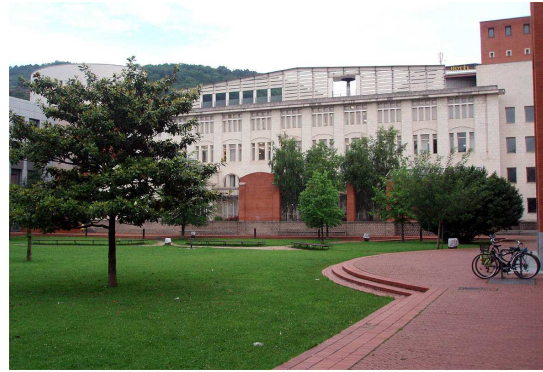
School of Architecture (Arquitectura)

There is no entrance to the School of Architecture though that square. To enter the building go to the right part of the square and search for the red brick building with four doors. Enter the building and you will find the Bridges reception desk at the end of the main passage of the School. The art gallery is placed behind the first door of the left.