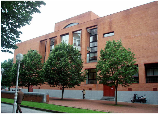
Magisterio / Majisteritza

The most important street of the zone is Avenida Tolosa / Tolosa Hiribidea, that crosses the university campus and leads to Ondarreta Beach. The most well known and visible building of the zone is Magisterio (Spanish) / Majisteritza (Basque), which give name to the bus stop. The School of Architecture (Arquitectura) is placed closed to Magisterio in a square with a small park called Plaza de Oñati.