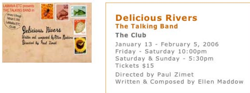
Figure 6: Delicious Rivers

(ix) Model building for everyone One of the most charming events, one that lasted almost the entirety of the conference, was the creation, in situ, of two colorful geometric constructions. In the words of Doris Schattschneider, "In the lobby outside the lecture hall, there were always a few children, participants, and spouses seated or kneeling on the floor, busy joining 3,720 ZomeTool connector balls to 10,680 struts in modules that each hour were added to two growing monster models, [3D] shadows of the 4D cantellated 600-cell. David Richter and Daniel Duddy orchestrated the project." One of the two models was donated by the ZomeTool people to BIRS where it has a permanent place in the Corbett Hall lounge.