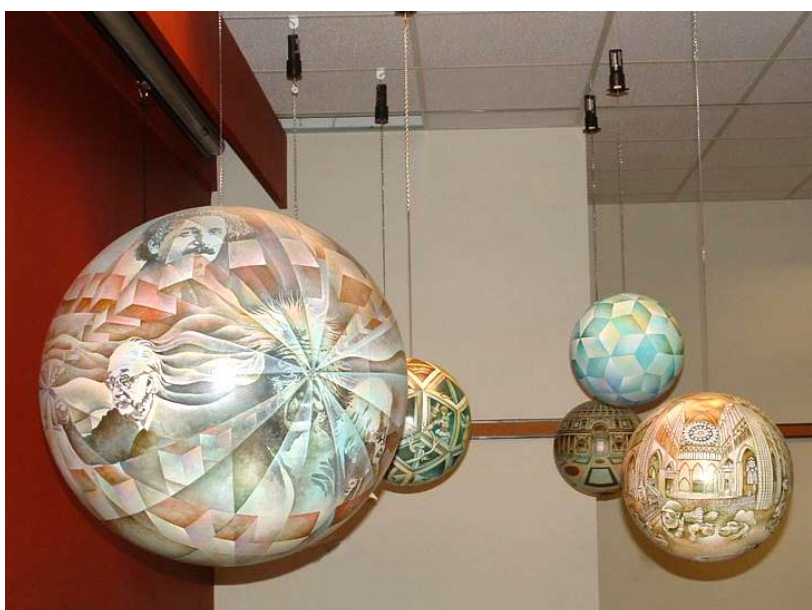
Figure 4: Some of Dick Termes' spheres